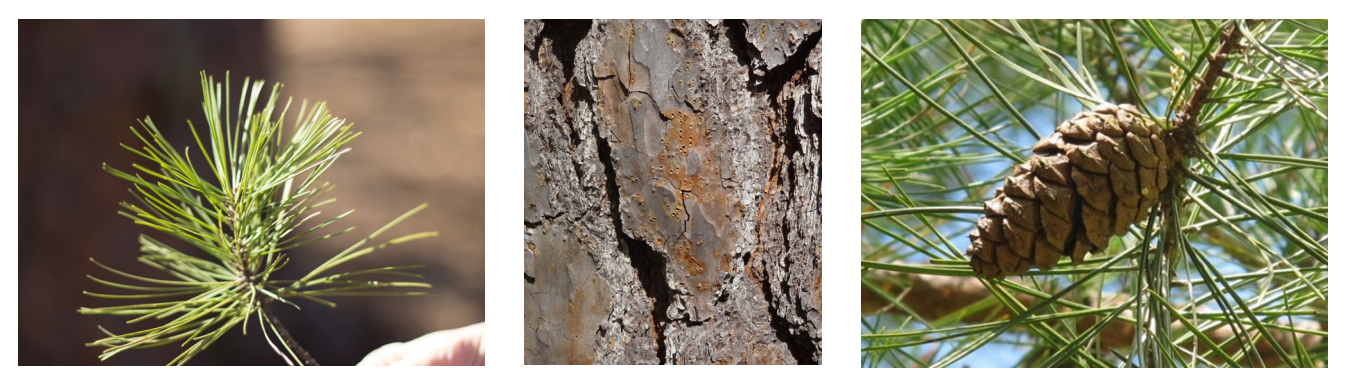
Figure 2: Shortleaf pine needles (left image). Shortleaf bark, with circular resin pockets (middle). Shortleaf cones (right).

cone crops happen every 3–6 years in the southern and western areas of its range; and 3–10 years in the northern and eastern areas.<sup>6</sup> Overall, poor, irregular seed crops are common for shortleaf pine. Seedfall begins in late October to early November with a majority of the seed falling 75 to 150 feet from the tree. Each of the small cones contains 25–30 seed. A tree may have 130 cones in a good year.