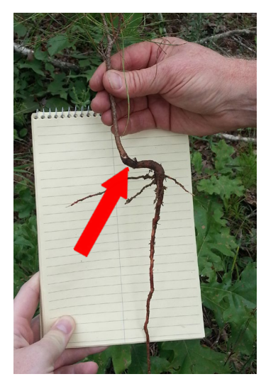
Figure 3: This shortleaf seedling shows the species' unique basal crook (arrow indicates), where it sprouts from following fire damage.

cone crops happen every 3–6 years in the southern and western areas of its range; and 3–10 years in the northern and eastern areas.<sup>6</sup> Overall, poor, irregular seed crops are common for shortleaf pine. Seedfall begins in late October to early November with a majority of the seed falling 75 to 150 feet from the tree. Each of the small cones contains 25–30 seed. A tree may have 130 cones in a good year.