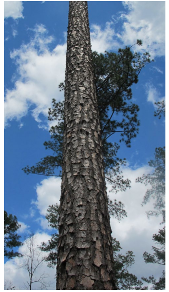
Figure 4: This 70 year old shortleaf depicts the straightness, taper, small branches, and slow growth desired for top grade lumber.

Shortleaf pine is a valued timber tree. Its wood quality, including the juvenile wood, is superior to loblolly pine. The qualities required for high grade sawtimber include; straightness, low taper, high wood density, small branches, high proportion of latewood, and no fewer than 4 growth rings in the last inch of radial growth.<sup>1,12</sup> At age 40 the proportion of high-value pole size timber may be as high as 40 percent. Most studies have documented that loblolly pine has 10-15 point site quality index (base 50) advantage over shortleaf pine. However, Harrington reported the difference