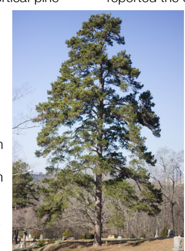
Figure 5: Shortleaf as an attractive landscape specimen at a Georgia site.

between loblolly and shortleaf site quality indexes decreased as the site quality increased; the highest quality sites have little or no growth advantage.<sup>3</sup> Shortleaf also makes a valuable landscape tree in urban and residential areas (Fig. 4).