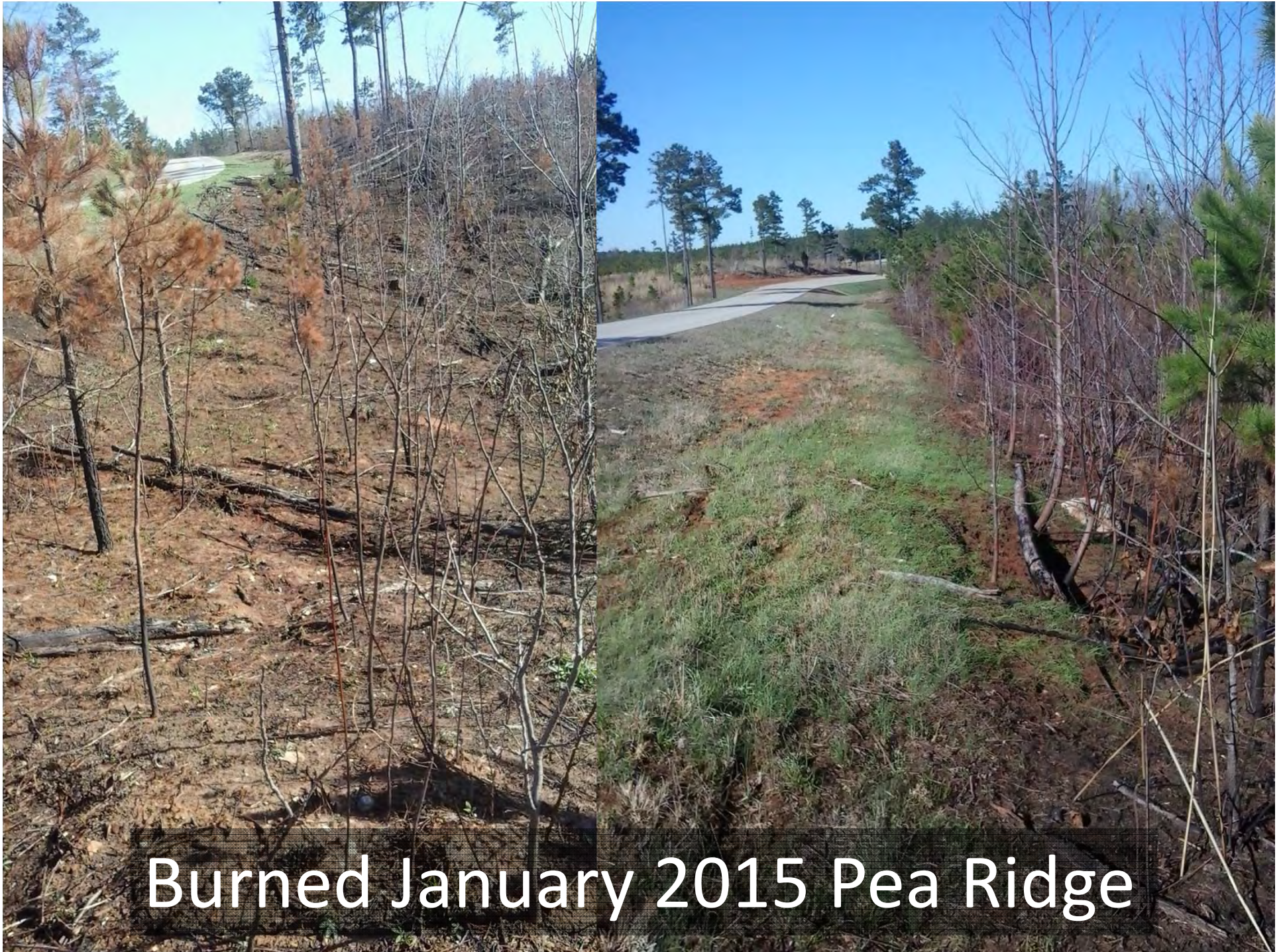
Burned January 2015 Pea Ridge