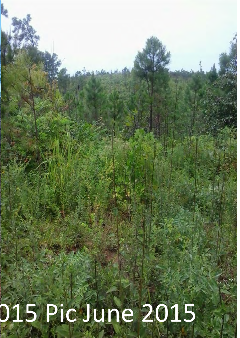
Burned January 2015 Pic June 2015