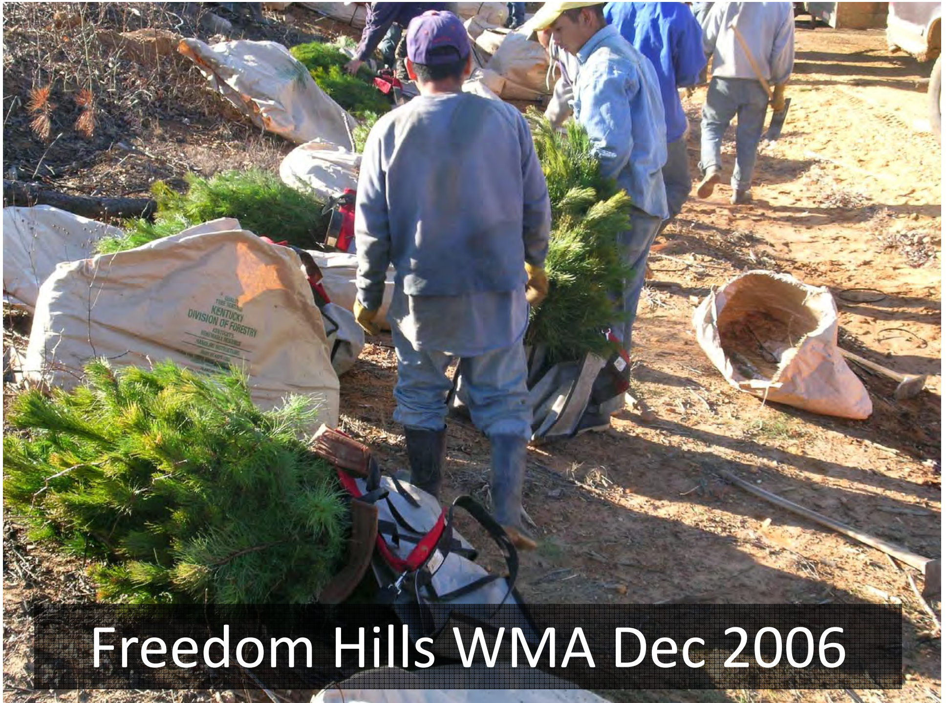
Freedom Hills WMA Dec 2006