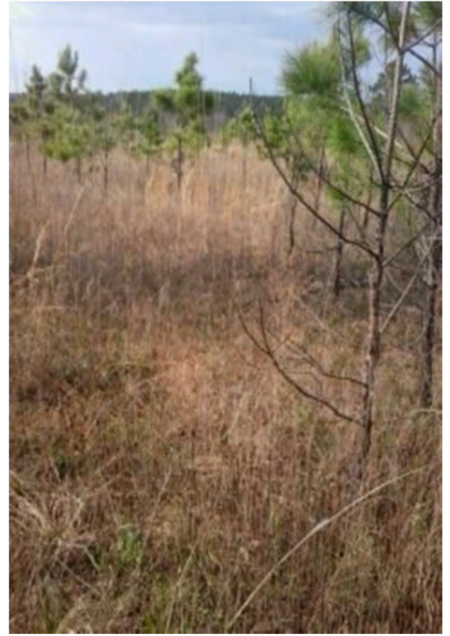
Burned January 2014 pic March 2015, FH WMA