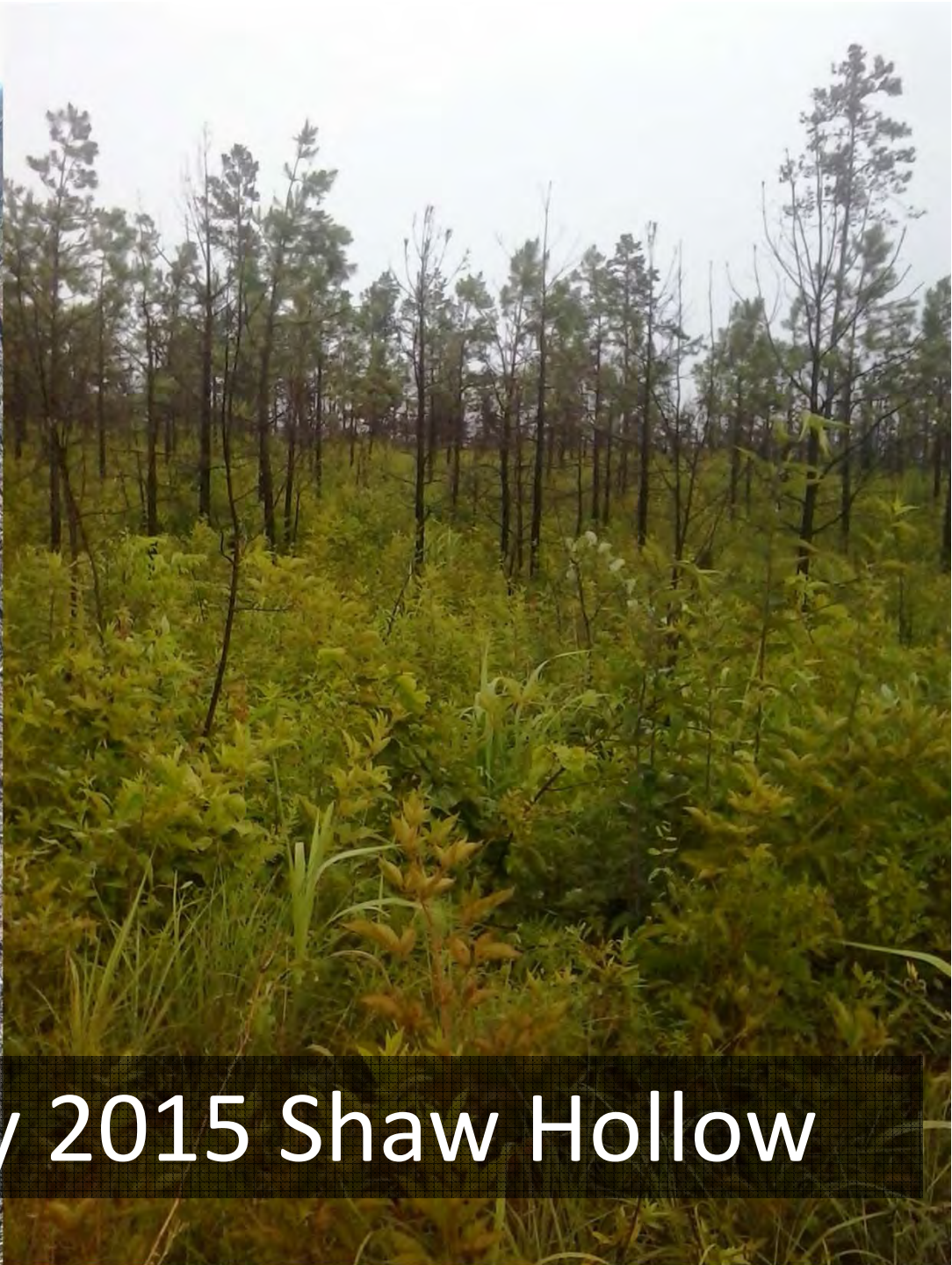
Burned January 2015 Shaw Hollow