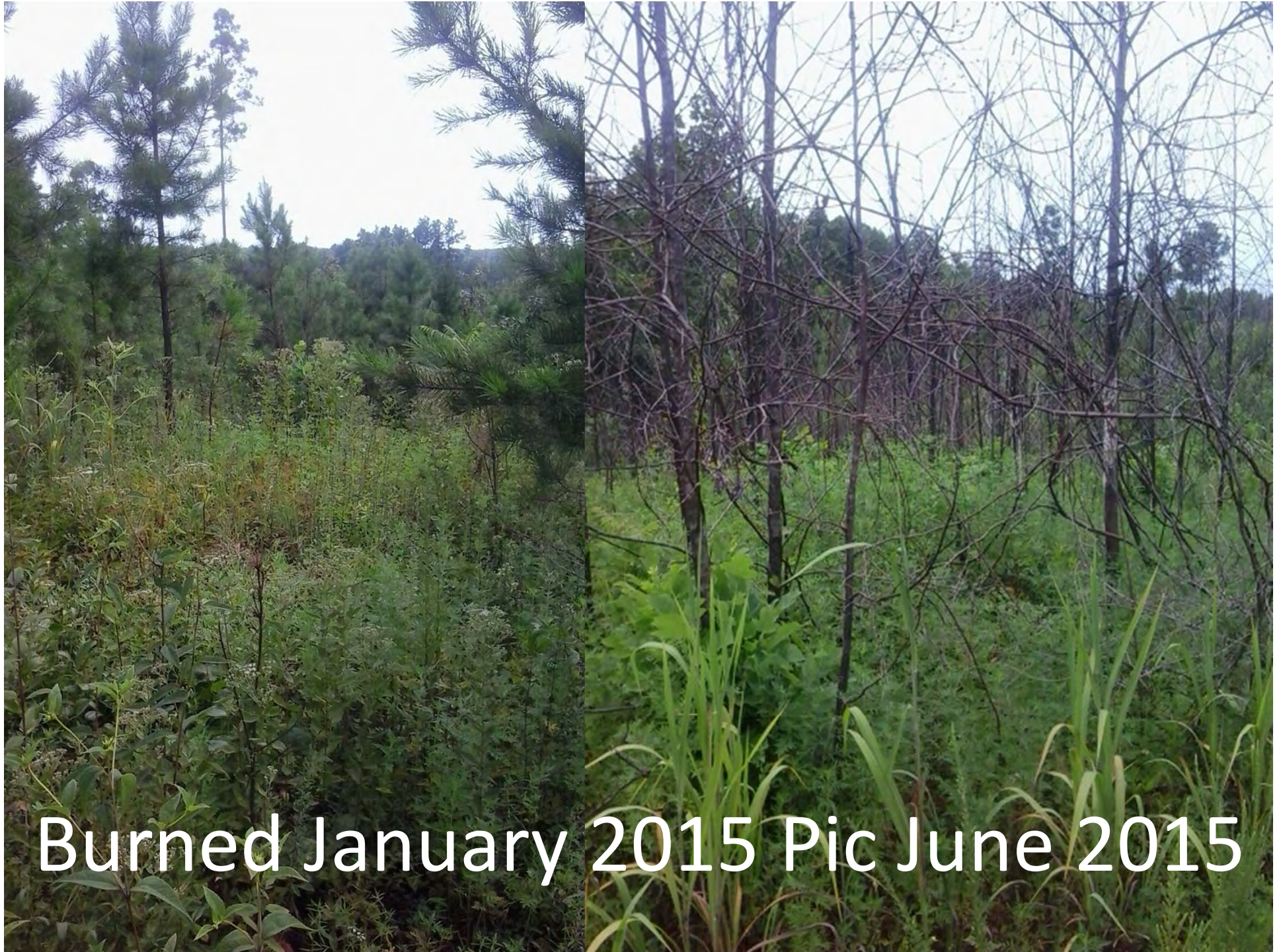
Burned January 2015 Pic June 2015