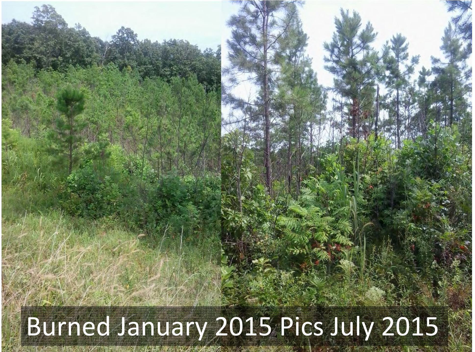
Burned January 2015 Pics July 2015