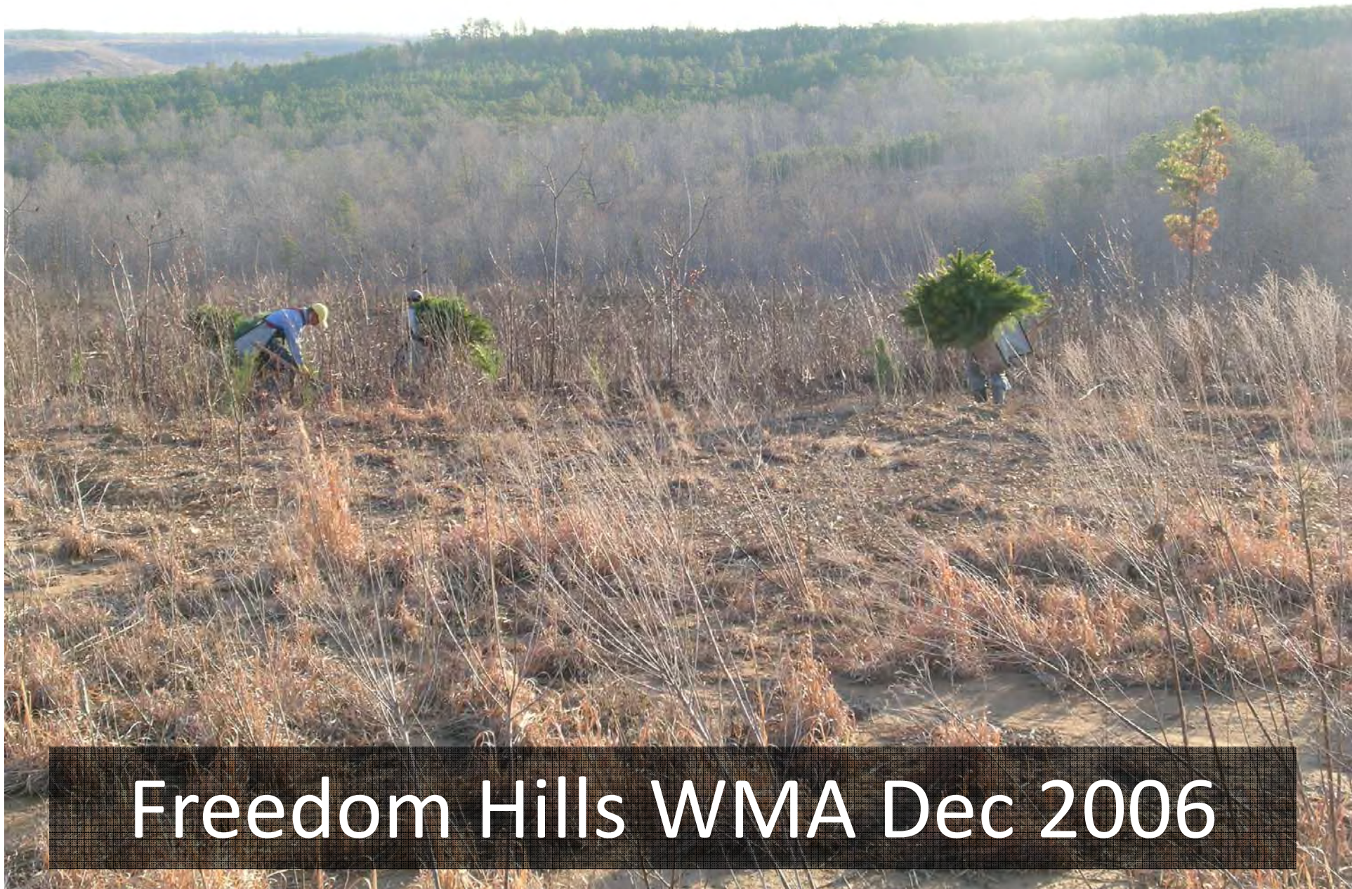
Freedom Hills WMA Dec 2006