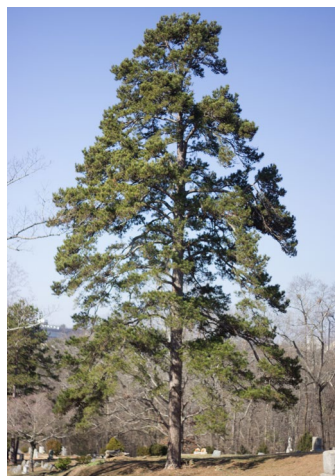
Figure 5: Shortleaf as an attractive landscape specimen at a Georgia site.

10–20 years. By age 20, its growth rate becomes close to that of loblolly pine and around age 50 is greater. 10 The steady growth rate and the species greater lifespan favor long rotations. 9 Shortleaf is shade intolerant. Foresters usually manage it as an even aged stand. It persists in very dense stand conditions and responds to release thinning even when the trees are mature. 6,13 Shortleaf tolerates competition longer than loblolly pine. Control of understory competition increases the growth rate. Its growth rate and sprouting ability is similar to