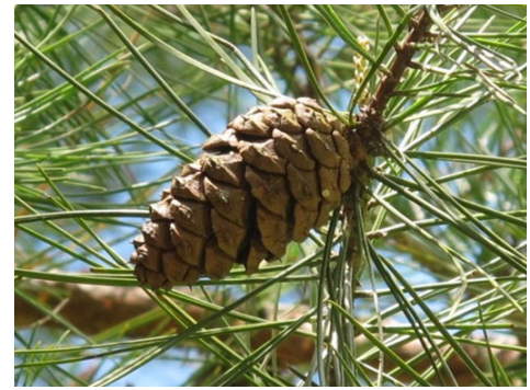
Figure 2: Shortleaf pine needles (left image). Shortleaf bark, with circular resin pockets (middle). Shortleaf cones (right). Credit: Megan Robertson, Holly Campbell, and Bill Pickens.

cone crops happen every 3–6 years in the southern and western areas of its range; and 3–10 years in the northern and eastern areas. 6 Overall, poor, irregular seed crops are common for shortleaf pine. Seedfall begins in late October to early November with a majority of the seed falling 75 to 150 feet from the tree. Each of the small cones contains 25–30 seed. A tree may have 130 cones in a good year.