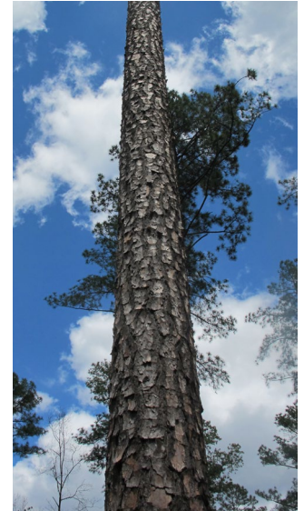
Figure 4: This 70 year old shortleaf depicts the straightness, taper, small branches, and slow growth desired for top grade lumber.

Shortleaf pine is a valued timber tree. Its wood quality, including the juvenile wood, is superior to loblolly pine. The qualities required for high grade sawtimber include; straightness, low taper, high wood density, small branches, high proportion of latewood, and no fewer than 4 growth rings in the last inch of radial growth. 1,12 At age 40 the proportion of high-value pole size timber may be as high as 40 percent. Most studies have documented that loblolly pine has 10–15 point site quality index (base 50) advantage over shortleaf pine. However, Harrington reported the difference