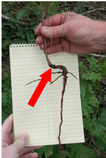
Figure 3: This shortleaf seedling shows the species' unique basal crook (arrow indicates), where it sprouts from following fire damage.

Foresters describe the growth of shortleaf pine as slow but steady. For its first two years, shortleaf pine uses most of its resources developing a root system. During this period, faster growing competitors easily overtop it. Shortleaf pine feeder roots are smaller and more abundant in the upper few inches of the soil than loblolly. 11 It is considered windfirm thanks to a deep taproot and extensive lateral roots. 4,8 Shortleaf pine exhibits slow annual growth rate during its first